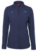
WOMEN'S SOFTSHELL JACKET CODE: WR025