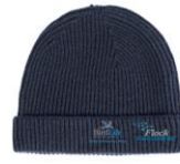
BEANIE CODE: BEANIE