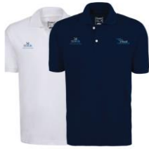
THE CLASSIC 100% COTTON GOLFER CODE: JGSHT