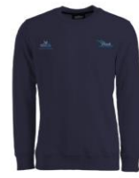
100% COTTON CREW NECK SWEATER CODE: WR034