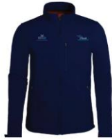
SOFTSHELL JACKET CODE: WR023