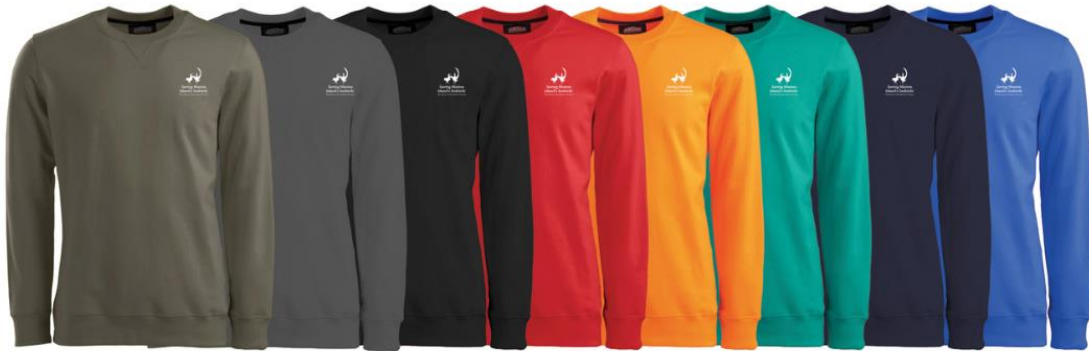
Mouse Free Marion: 100% Cotton Crew Neck Sweater