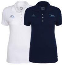
THE CLASSIC 100% COTTON WOMEN'S GOLFER CODE: LGSHT