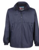
WATER DEFENDER FLEECE JACKET CODE: J608W