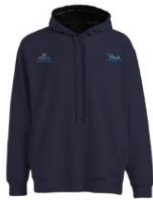
100% COTTON HOODIE CODE: HOODIE