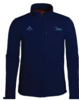
SOFTSHELL JACKET CODE: WR023