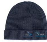
BEANIE CODE: BEANIE