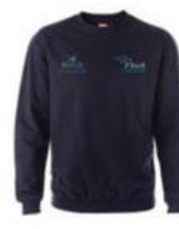
100% COTTON CREW NECK SWEATER CODE: WR034