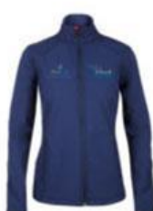
WOMEN'S SOFTSHELL JACKET CODE: WR025