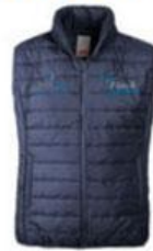
PACKABLE BODYWARMER CODE: WR040