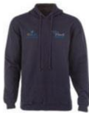
100% COTTON HOODIE CODE: HOODIE