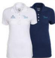
THE CLASSIC 100% COTTON WOMEN'S GOLFER CODE: LGSHT