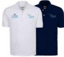
THE CLASSIC 100% COTTON GOLFER CODE: JGSHT