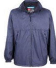
WATER DEFENDER FLEECE JACKET CODE: J608V