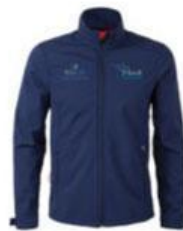
SOFTSHELL JACKET CODE: WR023